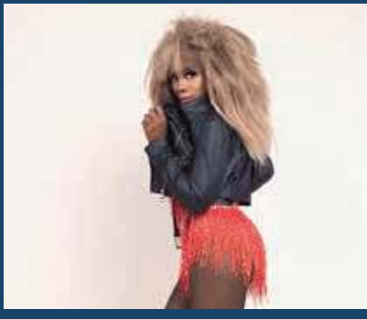
Friday 28<sup>th</sup> November Nigi as Tina Turner

Join us for an enchanting evening of festive tradition and cheer. Indulge in a sumptuous three-course meal served with freshly brewed coffee, followed by captivating live entertainment. Then, dance the night away as our resident DJ keeps the festive spirit alive with your favourite tunes at our lively disco. *Minimum of six quests per table*